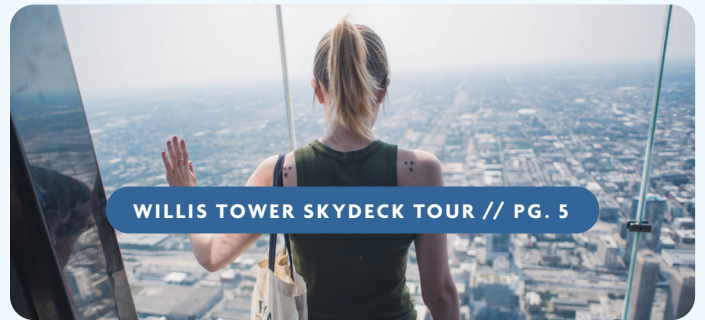
WILLIS TOWER SKYDECK TOUR // PG. 5