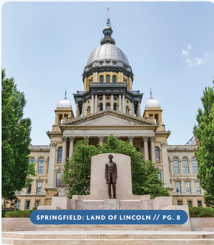
SPRINGFIELD: LAND OF LINCOLN // PG. 8