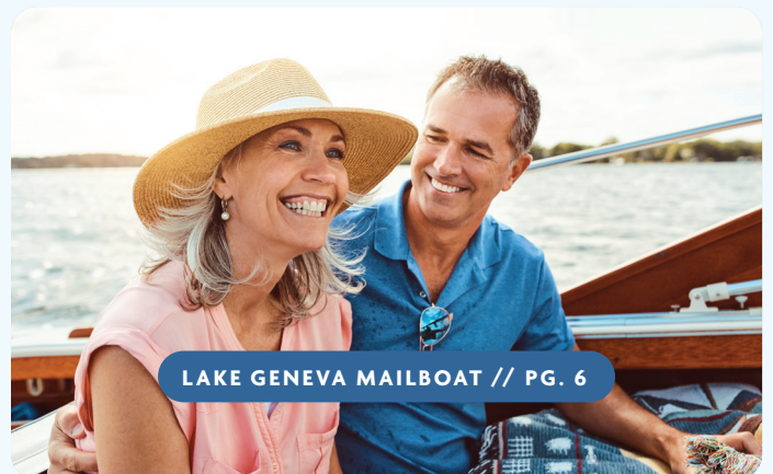
LAKE GENEVA MAILBOAT // PG. 6